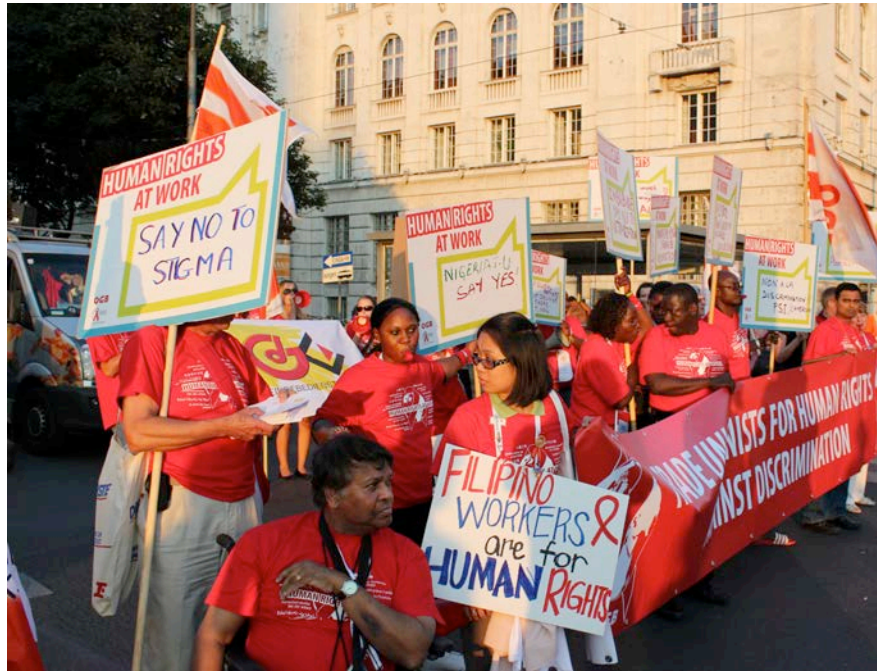
Courtesy of Jefferson Press. This image is exclusively for non-commercial purposes. You are not authorized to modify, copy, sell, transmit or otherwise distribute this file without the prior written authorization of Jefferson Press.