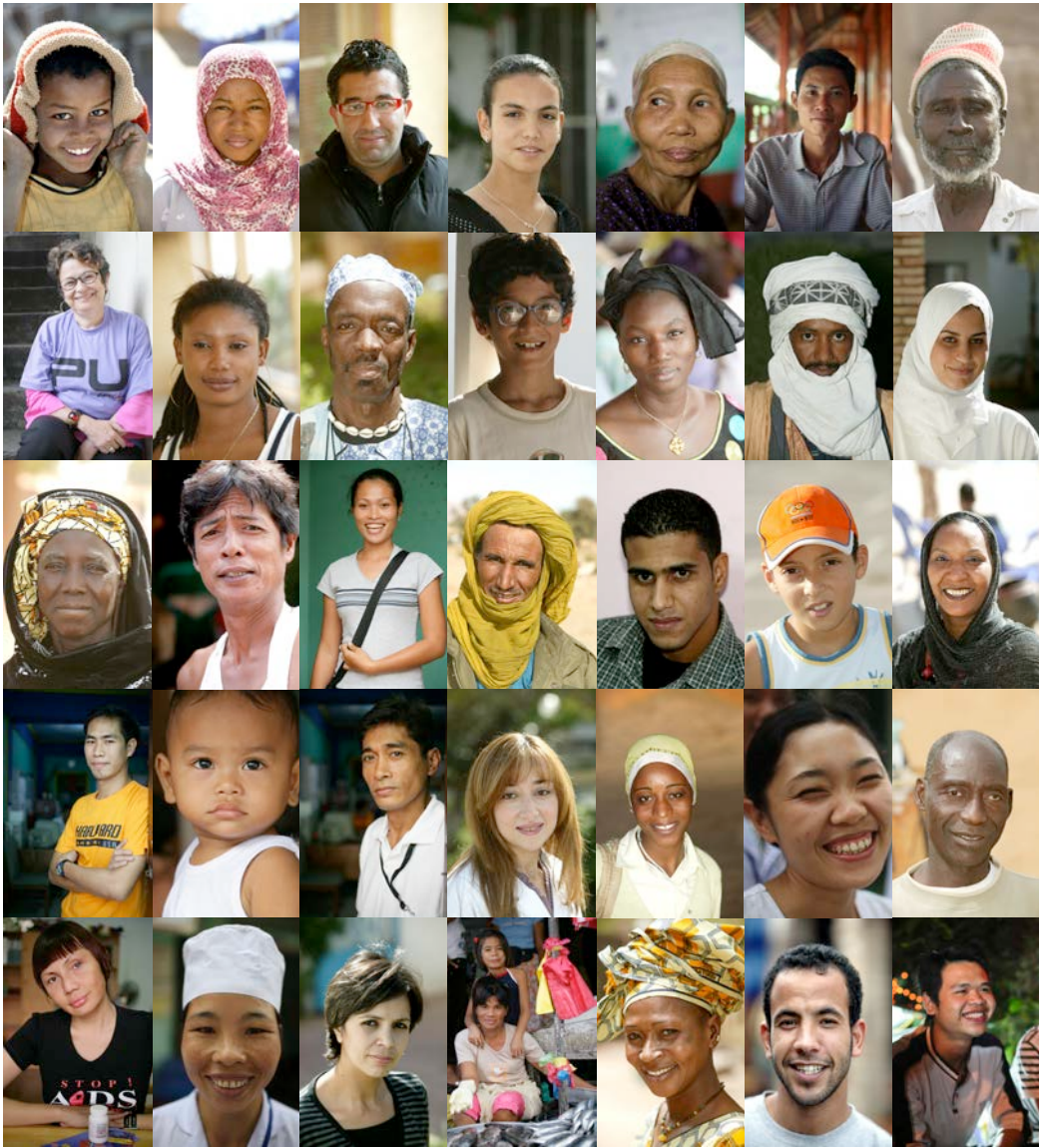
Courtesy of UNAIDS. This image is exclusively for non-commercial purposes. You are not authorized to modify, copy, sell, transmit or otherwise distribute this image without the prior written authorization of UNAIDS.

Revitalizing The HIV Response - 2011 And Beyond