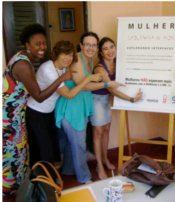
Courtesy of Mabel Blanco. This image is exclusively for non-commercial purposes. You are not authorized to modify, copy, sell, transmit or otherwise distribute this image without the prior written authorization of Mabel Blanco.