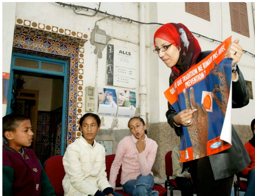
Courtesy of UNAIDS. This image is exclusively for non-commercial purposes. You are not authorized to modify, copy, sell, transmit or otherwise distribute this image without the prior written authorization of UNAIDS.

As the pandemic matures and its long-term impact becomes more apparent, there is a clear need for even greater cooperation and identification of synergies between health, human rights and social justice movements, as well as between AIDS and other global movements. A key challenge before global civil society is to better leverage these synergies to consolidate prevention, care and treatment gains, as well as to ensure adequate funding streams that will enhance access to essential HIV services and create more enabling environments for those affected. Where are these synergies and opportunities? And how will the role of civil society evolve to help bridge diverse movements for mutual benefit in the years to come?